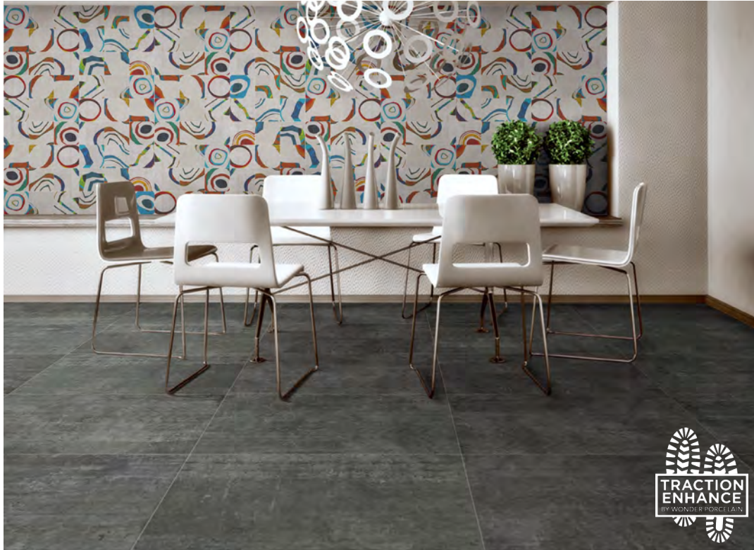
Features Coal AS03 Traction Enhance™ Technology 12" x 24"

With the appearance of a time-worn cement texture, the Asher Porcelain™ series provides an intriguing blend of the ancient and the urbane. Offered in large format field tile sizes and three colors, Asher is an ideal series for a touch of the avant-garde. Asher's Traction Enhance™ Technology finish, maintains a DCOF result of \geq 0.60 when wet, making Asher ideal for most installations. A trim package including a 4" x 12" Bullnose, 6" x 12" Cove Base and 1" x 6" Cove Base Corner rounds out the series.