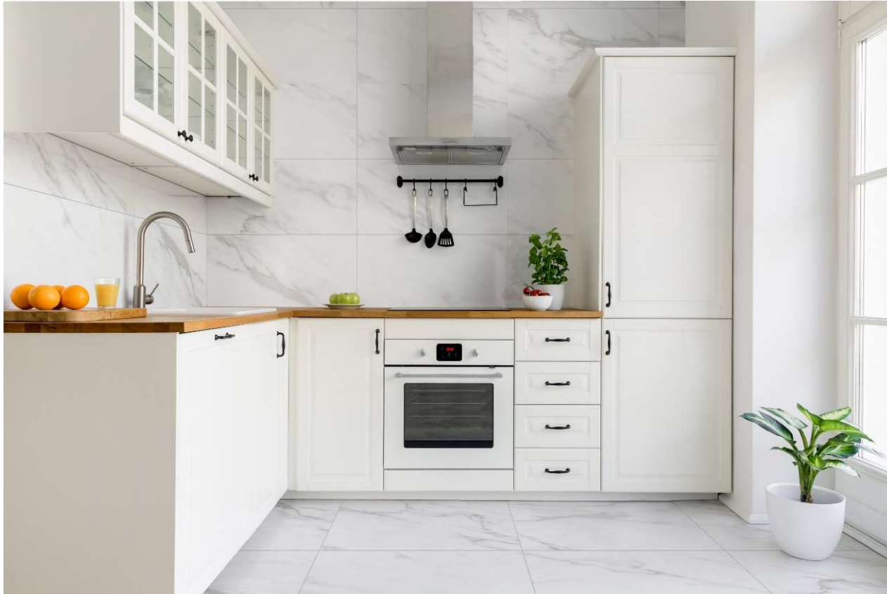
Features Bianca CZ01 Polished 12" x 24"

Reflecting the rare beauty of Italian marble, the Carenza Porcelain™ series offers two beautiful color combinations: a soft light gray background with pewter tones, Bianca CZ01, and a crisp white background paired with golden tones, Oro CZ02. Its Polished and commercially-rated Matte finishes, large size package with a 4" Hex mosaic and trim package (6" x 12" Cove Base, 4" x 12" Bullnose and 1" x 6" Cove Base Corner) make it a perfect choice for bright, warm neo-classical environments.