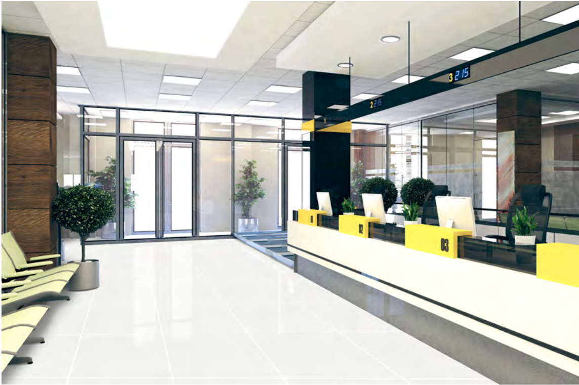
Features White Dune MS51 Polished 24" x 48"

Mars Stone II Porcelain™ is the stylish marriage of a light granite and terrazzo look, with an on-trend color palette. This series is offered in both an eye-catching, sleek Polished finish and an innovative, High DCOF Matte finish. With a size package featuring large formats, a 2" x 2" Mosaic and assorted trim (6" x 12" Cove Base, 3" x 12" Bullnose and 1" x 6" Cove Base Corner), this series offers the complete package for any commercial or residential project.