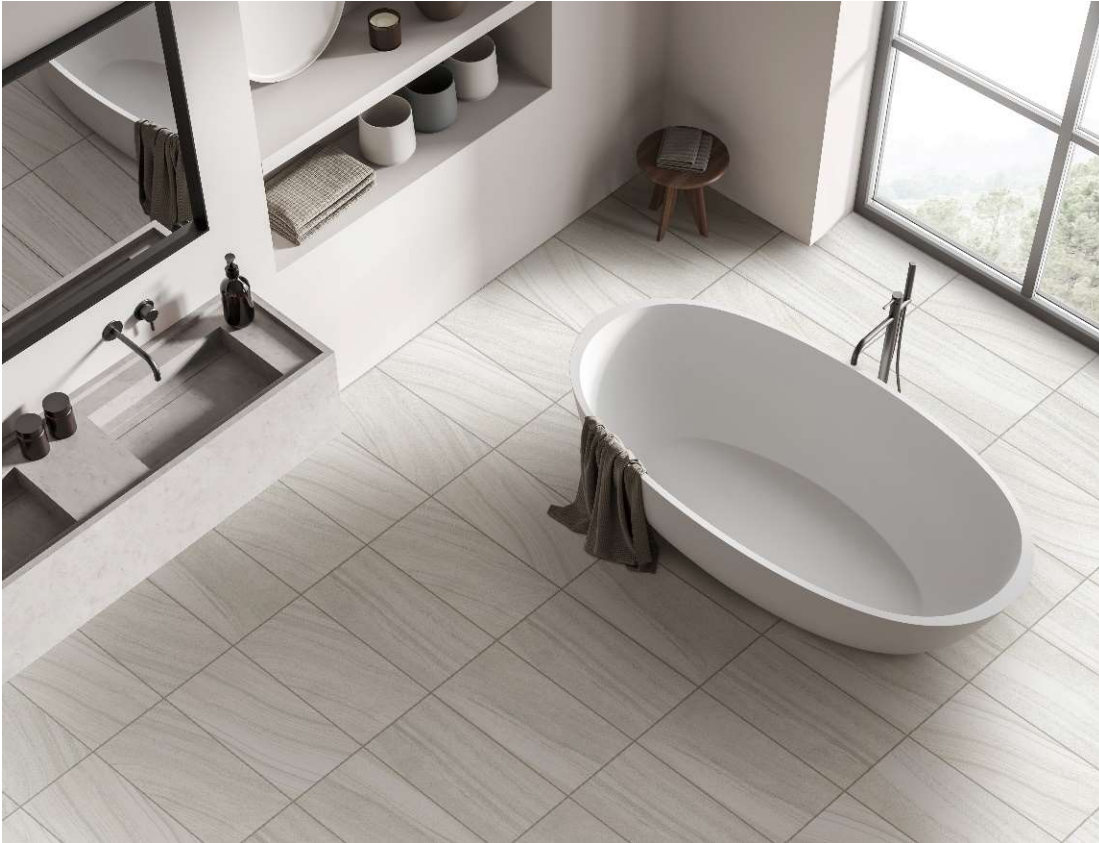
Features White SA01 Matte 12" x 24"